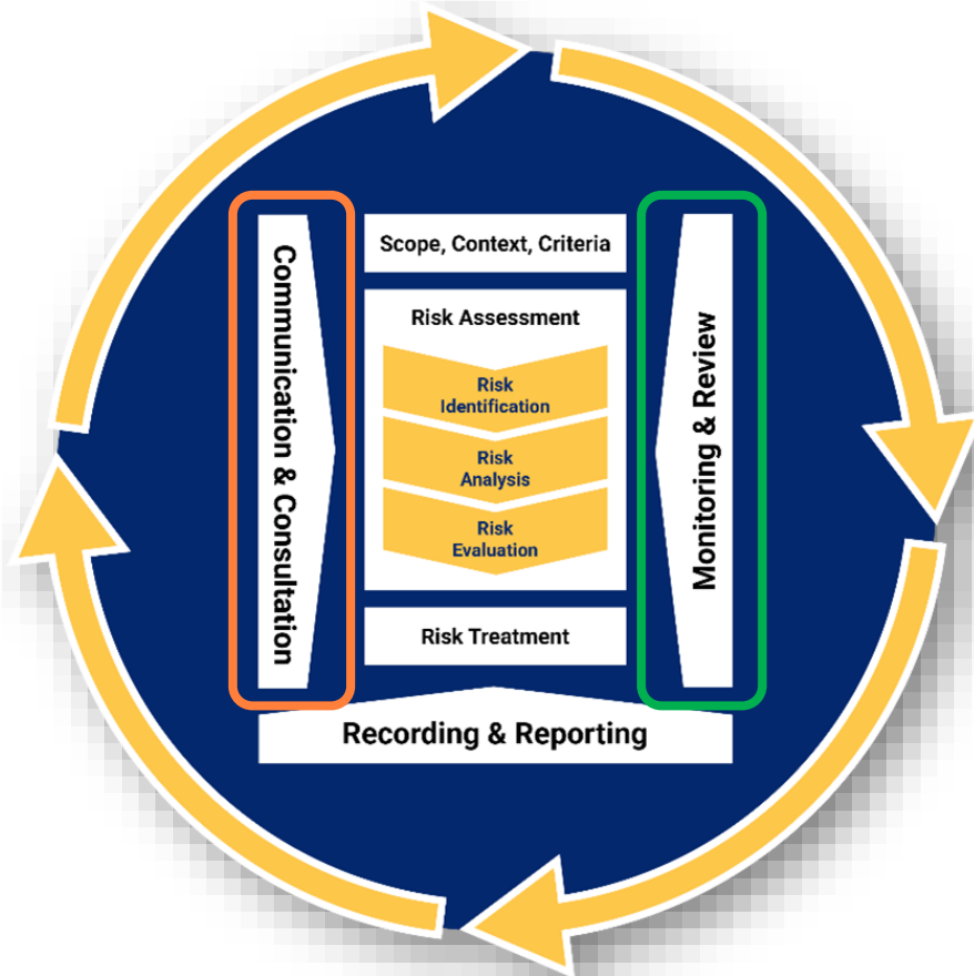
Figure 4: 2018 Risk Management Process ongoing and periodic activities

The ongoing activities reflect the right-hand portion of the framework diagram “Monitoring and Review,” indicated in green, and the periodic activities reflect the left-hand portion of the framework diagram “Communication and Consultation,” indicated in orange.