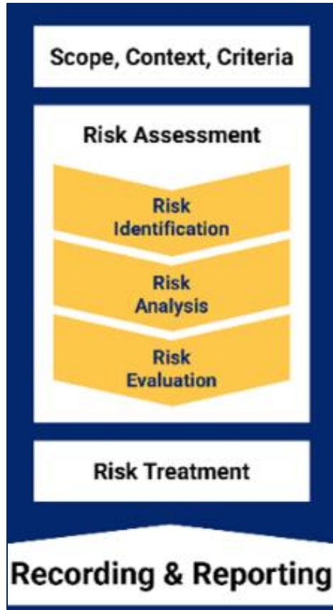
Figure 3: Five risk management steps.

Each reliability and security risk examined through the WECC RMP progresses through the five steps, shown in the diagram below. Each step includes responsibilities for WECC staff and potentially Strategic Risk Partners.