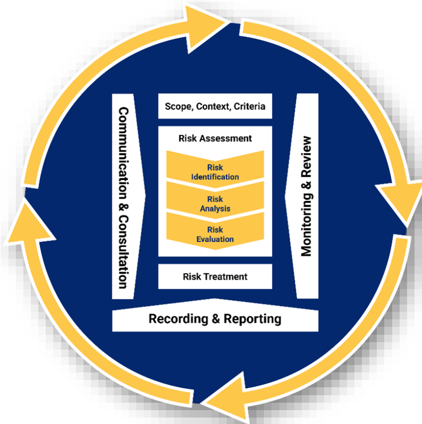
Figure 2: ISO 31000 – 2018 Risk Management Process. 3

The WECC RMP is based on the ISO 31000 Risk Management Process industry standard risk framework shown in Figure 2.