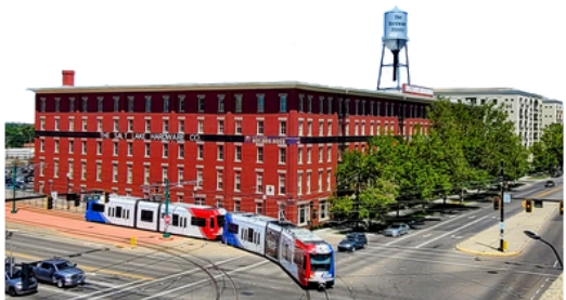
WECC OFFICE Salt Lake Hardware Building

155 North 400 West, Suite 200 Salt Lake City, UT 84103 801-582-0353 | www.wecc.org