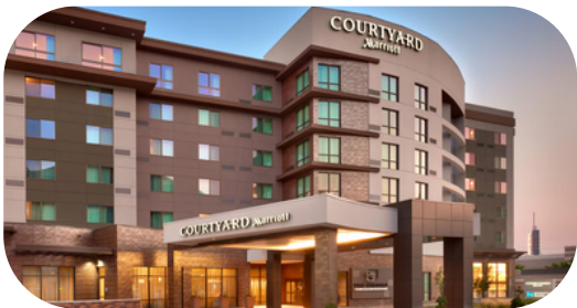
COURTYARD SALT LAKE CITY DOWNTOWN*