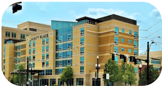
HYATT PLACE SALT LAKE CITY/DOWNTOWN/THE GATEWAY*