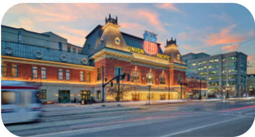
ASHER ADAMS AUTOGRAPH COLLECTION*