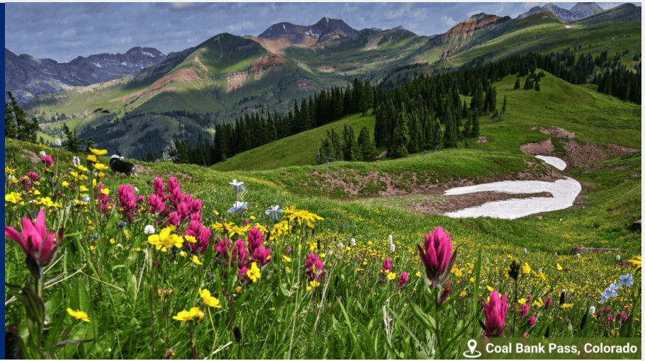
Coal Bank Pass, Colorado

New Look! WECC has transitioned to Constant Contact to enhance our communication. You may notice a new look for our products, but our commitment to keeping you informed about reliability in the Western Interconnection remains unchanged.